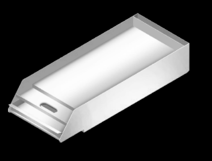
GRID30 289mm x 136mm x 722mm