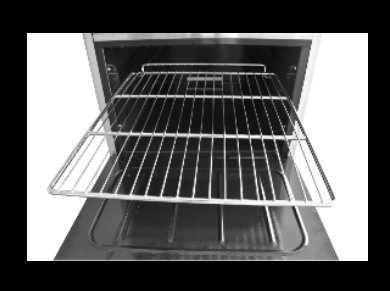
AT80G4B-O / AT80G8B-O WIRE13