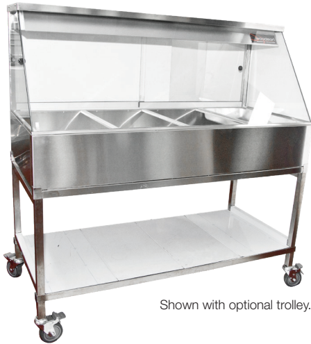
Shown with optional trolley.